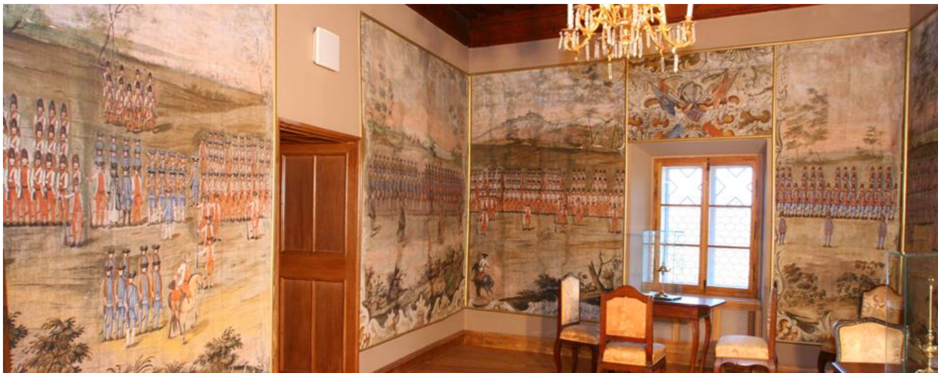
Tapestry in Trakošćan (18 th century)